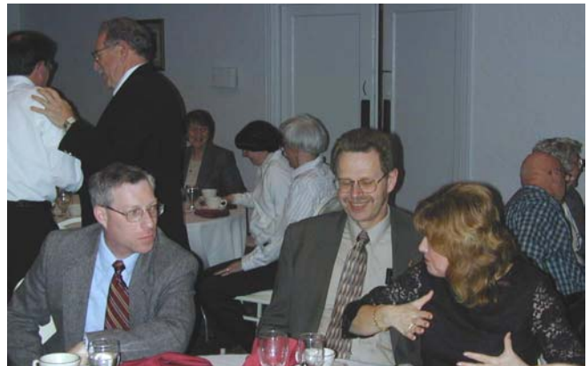
AARA Dinner April 2003

ARRL Field Day 1800Z, Jun 28 - 2100Z, Jun 29