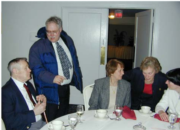
AARA Dinner April 2003